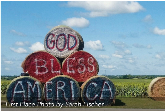
First Place