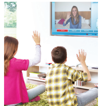
Cornerstone Group © 2015

A faster Internet speed can enhance the quality and performance of Skype calls. Call us today to visit with us about your Internet speed needs—SKT Customer Care at 888.758.8976.