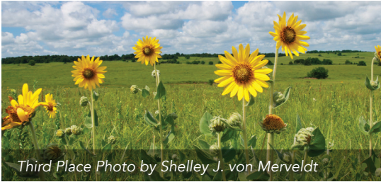
Third Place