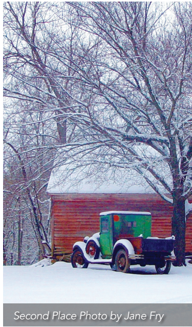
Second Place Photo by Jane Fry